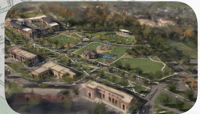
Centerville Town Center Aerial