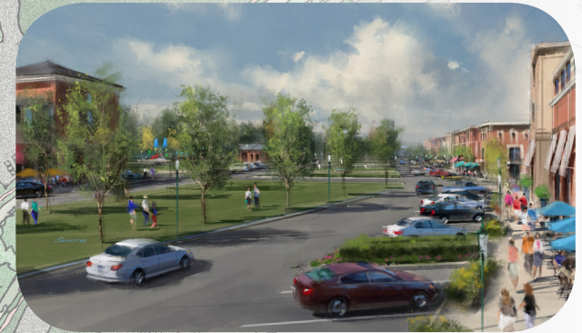
Southbound North Houston Lake Boulevard