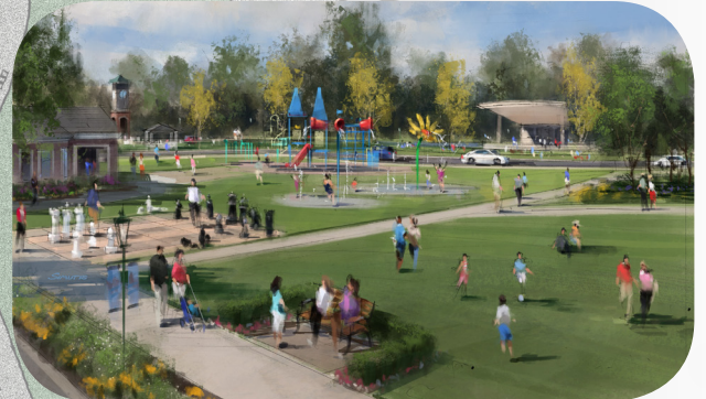
Center Park at Centerville